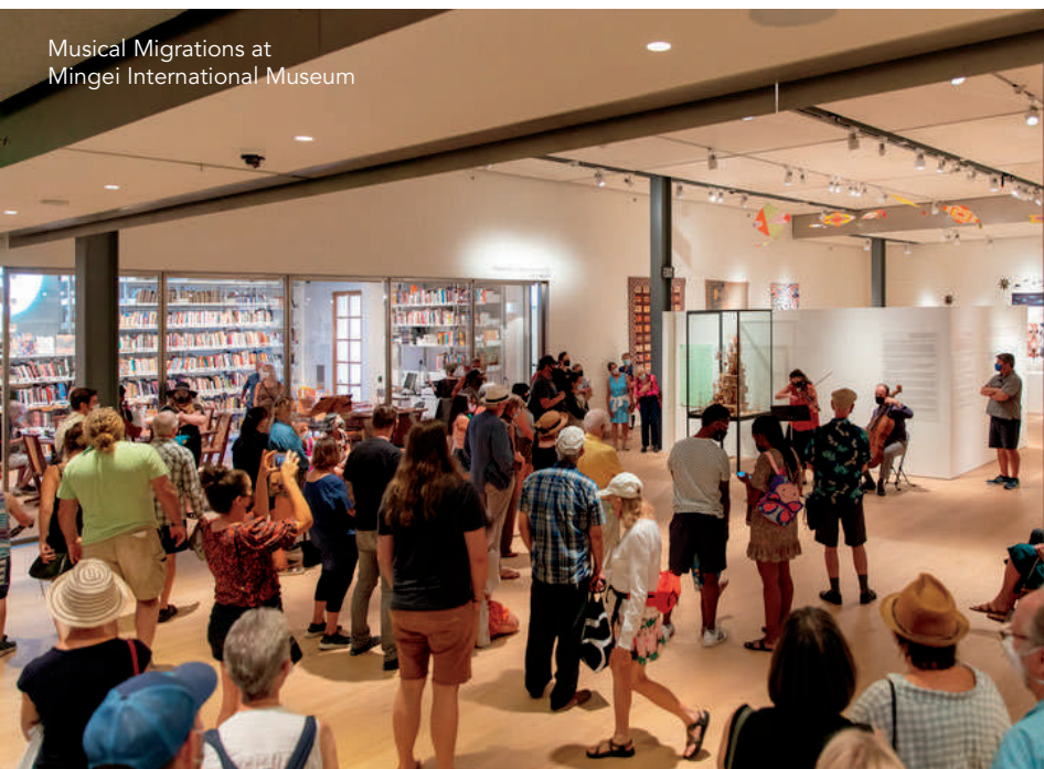
Musical Migrations at Mingei International Museum