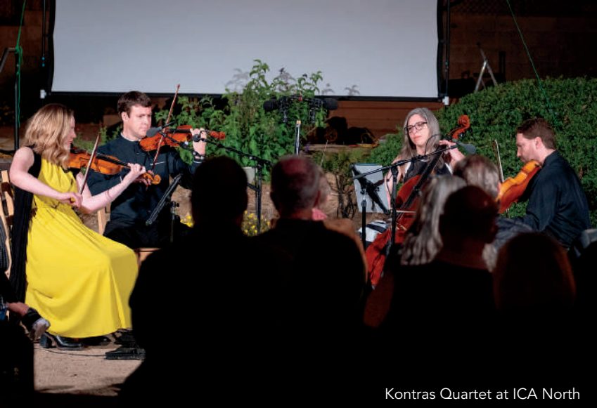
Kontras Quartet at ICA North