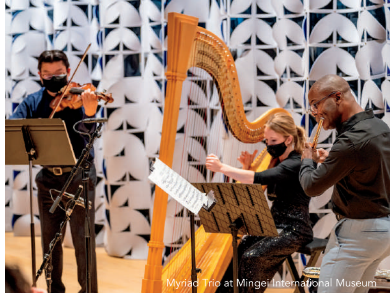
Myriad Trio at Mingei International Museum