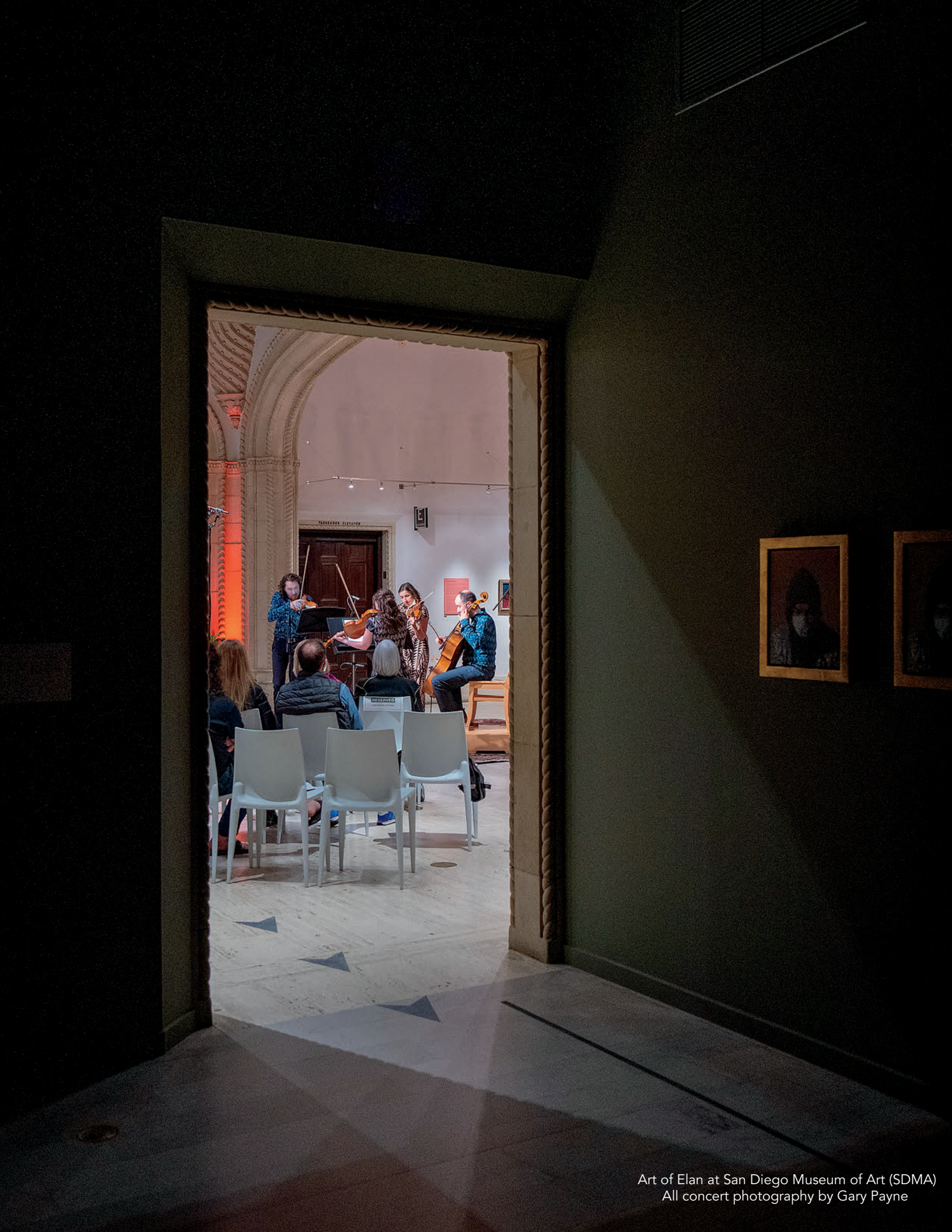
Art of Elan at San Diego Museum of Art (SDMA)