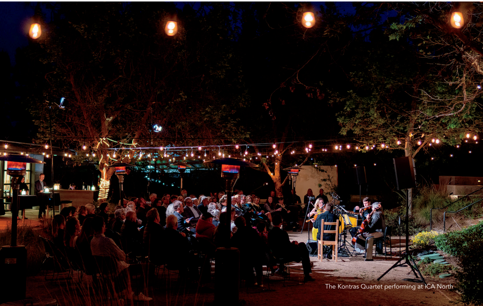
The Kontras Quartet performing at ICA North