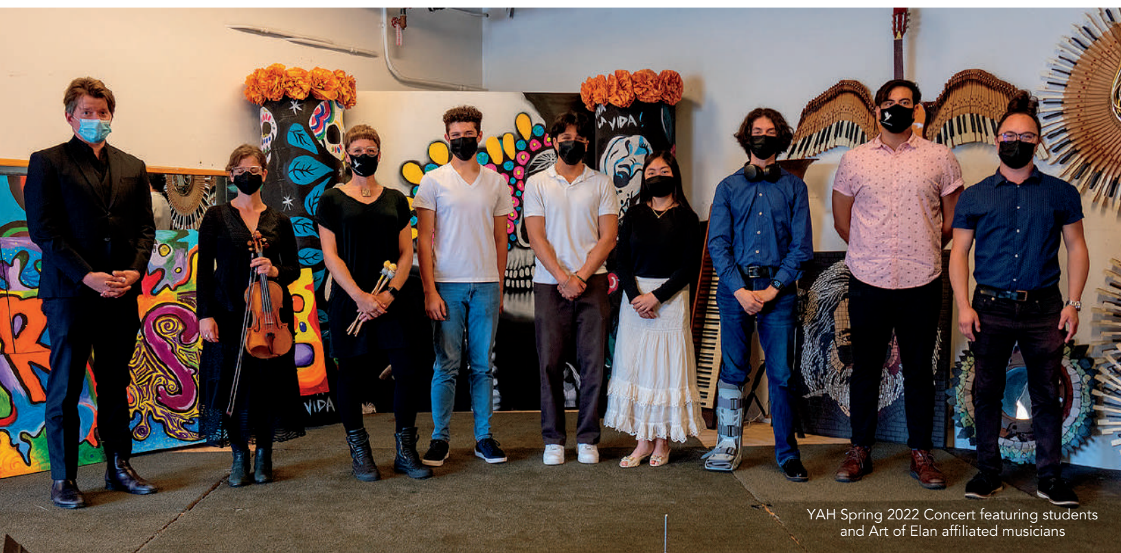
YAH Spring 2022 Concert featuring students and Art of Elan affiliated musicians