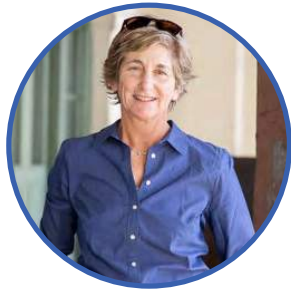
TONI ROBIN TR|PR PUBLIC RELATIONS