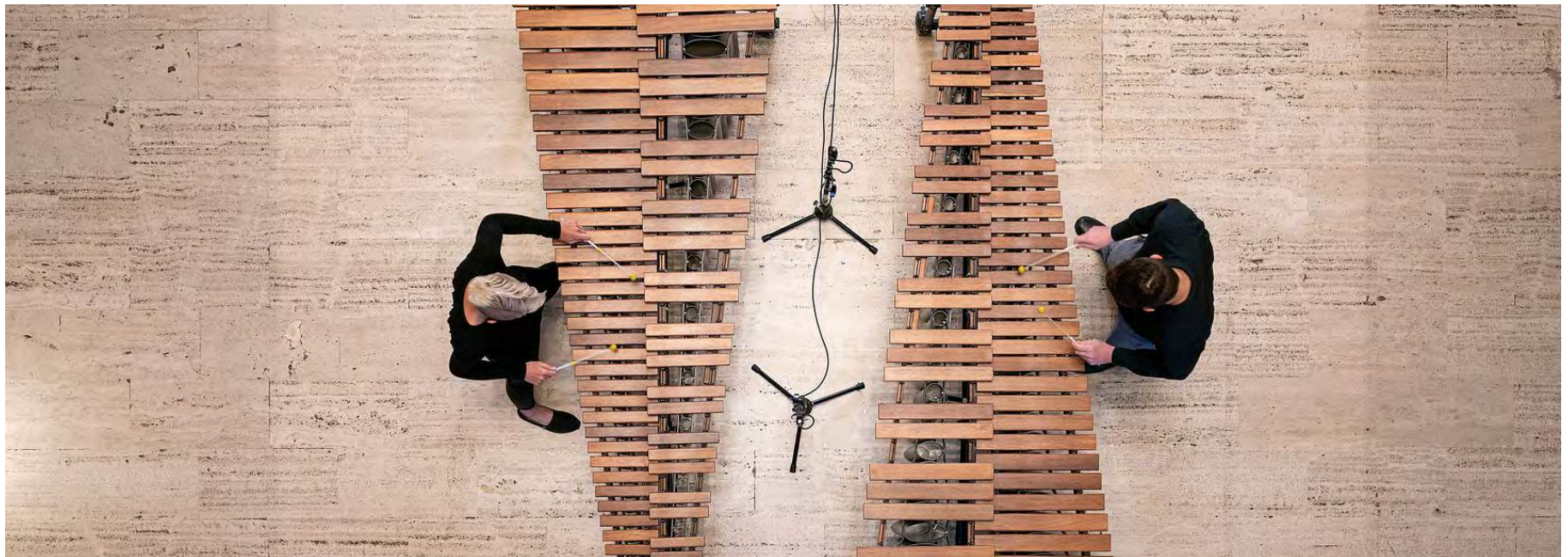
Concert

The mission of Art of Elan is to build community through music and enrich the cultural life of San Diego by presenting exciting and exceptional chamber music concerts, simultaneously educating and exposing diverse audiences to classical music through innovative programming, the commissioning of new works, unique performance venues and personal connections with concertgoers.