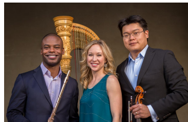
The Myriad Trio