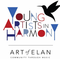
Young Artists in Harmony