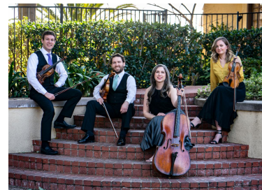
The Kontras Quartet