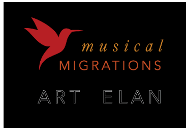
At Mingei International Museum

The culmination of the ten-week Spring 2022 Young Artists in Harmony program, this exciting concert will feature the world premiere performances of the compositions created by Spring 2022 Young Artists in Harmony participants, performed by Art of Elan musicians.