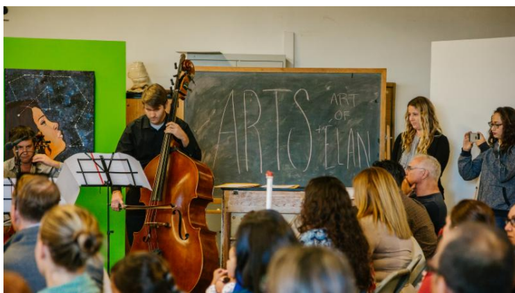
Young Artists in Harmony- 2015 Residency at A Reason to Survive (ARTS)