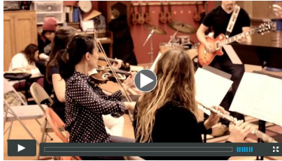
Young Artists in Harmony 2015