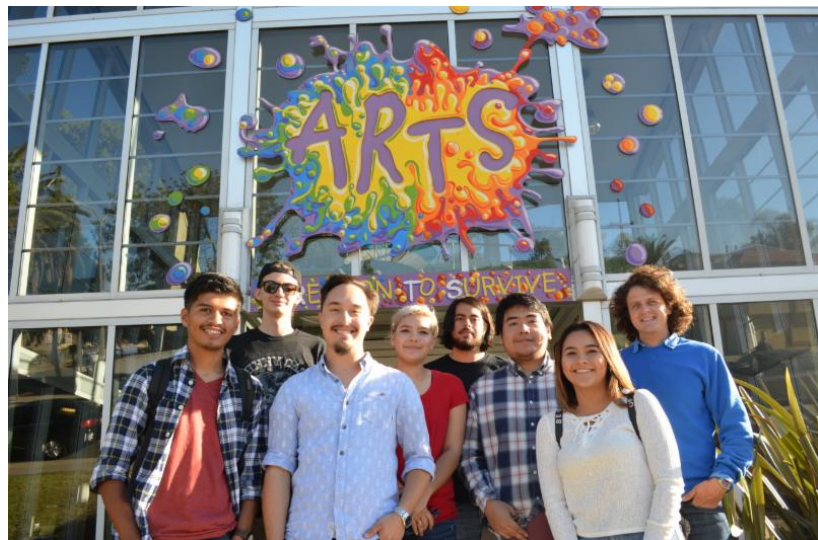
Young Artists in Harmony, 2016

As Art of Élan celebrates its 10th Anniversary Season titled "A Place to Call Home", the pioneering chamber music organization also launches its third annual Young Artists in Harmony program at A Reason to Survive (ARTS) in National City. This extremely unique Artist-in-Residence program features the apprenticeship of 10 National City music students to compose world premiere compositions performed by Art of Élan musicians in two concerts for the San Diego community.