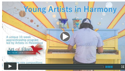
Young Artists in Harmony 2016