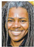
Stone Age) is 55. Actor Donna D'Errico ("Baywatch") is 53. Singer Celine Dion is 53. TV personality Richard Rawlings ("Fast N' Loud," "Garage Rehab") is 52. Actor Mark Consuelos ("Riverdale") is 50. Actor Bahar Soomekh ("Saw" films) is 46. Actor Jessica Cauffiel ("Legally Blonde" films) is 45. Singer Norah Jones is 42. Actor Fiona Gubelmann ("The Good Doctor") is 41. Actor Katy Mixon ("Mike and Molly") is 40. Country singer Justin Moore is 37. Actor Tessa Ferrer ("Grey's Anatomy") is 35. Country singer Thomas Rhett is 30. Rapper NF is 30.

Hilty is 40. Keyboardist PJ Morton of Maroon 5 is 40. Tuesday: TV personality Peter Marshall is 95. Actor John Astin is 91. Actor Warren Beatty is 84. Drummer Graeme Edge of the Moody Blues is 80. Musician Eric Clapton is 76. Actor Paul Reiser is 65. Rapper MC Hammer is 59. Actor Ian Ziering ("Beverly Hills 90210") is 57. Singer Tracy Chapman is 57. TV personality Piers Morgan is 56. Drummer Joey Castillo (Danzig, Queens of the Stone Age) is 45. Rapper Tony Jones is 42. Actor Fiona Gubelmann ("The Good Doctor") is 41. Actor Katy Mixon ("Mike and Molly") is 40. Country singer Justin Moore is 37. Actor Tessa Ferrer ("Grey's Anatomy") is 35. Country singer Thomas Rhett is 30. Rapper NF is 30. Wednesday: Actor William Daniels ("St. Elsewhere," "Boy Meets World") is 94. Actor Richard Chamberlain is 87. Actor Shirley Jones is 87. Musician Herb Alpert is 86. Actor Christopher Walken is 78. Comedian Gabe Kaplan ("Welcome Back Kotter") is 77. Guitarist Mick Ralphs of Bad Company and of Mott