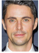
is 39. Singer Leona Lewis is 36. Actor Amanda Bynes is 35. Actor Rachel Bloom ("Crazy Ex-Girlfriend") is 34. Actor Hayley Kiyoko ("CSI: Cyber") is 30. Bassist Sam Kiszka of Greta Van Fleet is 22.

Saturday: Actor Marsha Mason is 79. Singer Wayne Newton is 79. Singer Tony Orlando is 77. Singer Richard Thompson is 72. Bassist Curtis Stone of Highway 101 is 71. Guitarist Mick Mars of Motley Crue is 65. Actor Alec Baldwin is 63. Actor David Hyde Pierce ("Frasier") is 62. Comedian-actor Eddie Murphy is 60. Singer-guitarist Mike Ness of Social Distortion is 59. Singer Sebastian Bach (Skid Row) is 53. Actor Jennie Garth ("Beverly Hills 90210") is 49. Actor Adam Scott ("Parks and Recreation") is 48.