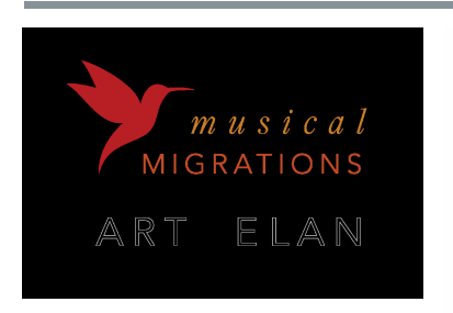
At Mingei International Museum

The culmination of the ten-week Spring 2022 Young Artists in Harmony program, this exciting concert will feature the world premiere performances of the compositions created by Spring 2022 Young Artists in Harmony participants, performed by Art of Elan musicians.