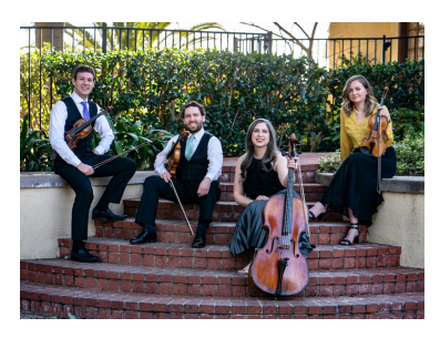
The Kontras Quartet